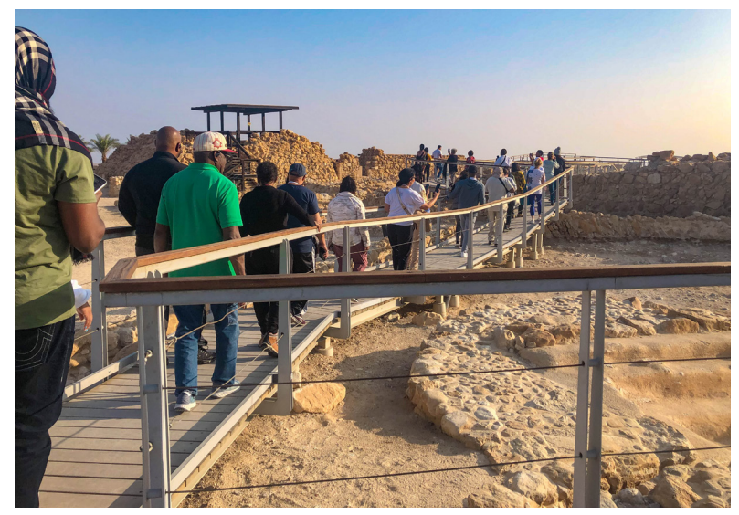
Tour = TH24 Code = B V. 002 01/30/23