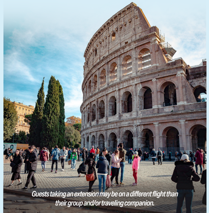
Guests taking an extension may be on a different flight than their group and/or traveling companion.

Transfer to the airport for your return flight to the USA.